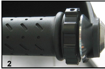
2 Assembled KAOKO™ Kit