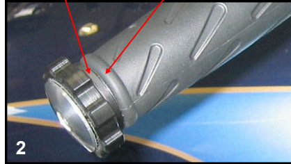
2 Assembled KAOKO™ Kit