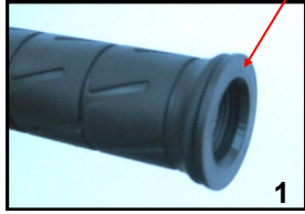
1 Bar Weight Removed with KAOKO™ Thrust Washer in place

Patents "U.S. Pat. No. US D593,462 S" "U.S. Pat. No. US D593,463 S" "U.S. Pat. No. US D593,464 S"