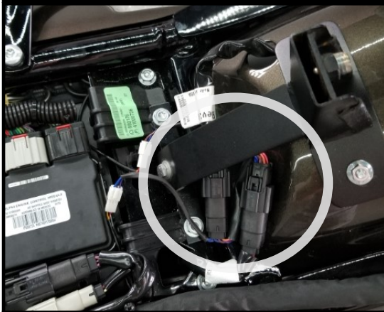
Harness Connector Location—Top Rear Fender

For: Road King, Electra Glide Ultra Classic, Electra Glide Ultra Classic Lo, Electra Glide Ultra Limited, Electra Glide Ultra Limited Lo, Road Glide Ultra CVO