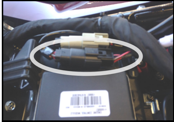
Harness Connector Location—on top of ECM

For: Road King, Electra Glide Ultra Classic, Electra Glide Ultra Classic Lo, Electra Glide Ultra Limited, Electra Glide Ultra Limited Lo, Road Glide Ultra CVO