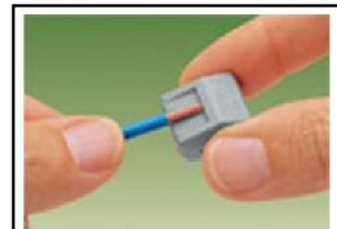
Strip wire 9-10 mm. Use wire gauge on bottom to verify.