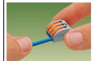
Then push down lever to its closed position.

Questions? Call us at: 1 (800) 382-1388 M-TH 8:30AM-5:30PM / FR 9:30AM-5:30PM EST