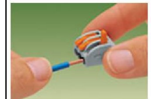
Push Lever up and insert wire...