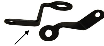
Turn signal relocation mounts

Mount the turn signal bracket to the original turn signal mount using the 8x25mm bolts & 8mm nuts and then mount the turn signals to this bracket. We suggest to drill two holes (one on each side) and guide the wires through the fender. If the bracket touches the fender, you may add the included washers to space between the provided turn signal mount and the original turn signal mount.