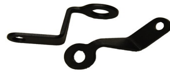
Turn signal bracket