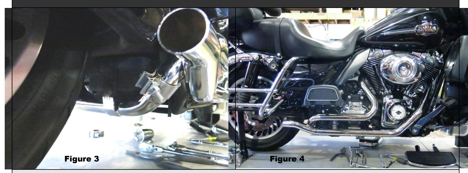
POWER YOU CAN FEEL