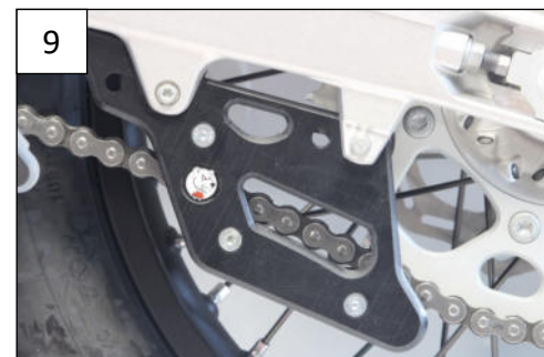
Placer le second bloc, clipser et serrer le tout avec les tfhc 6x55 + Rondelles M6 et les Em6f