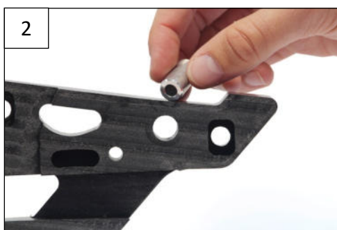
Place the alloy smooth spacer as indicated on the pictures Placer l'entretoise lisse comme indiqué sur les photos