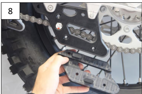
Place the second bloc, clip it and tight with the Tfhc 6x55mm screws, M6 Washers and em6f