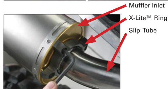
V.A.L.E.™ Assembly Detail