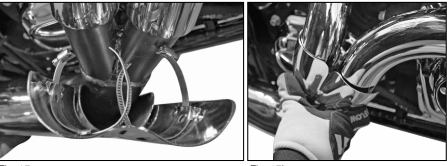
Fig. 17b Fig. 17a

7. Attach the Y-collector heat shield to the head pipe assembly by first sliding the bent tab underneath the midsection heat shield, then attaching the heat shield clamps. Do not tight the clamp at this time to allow for adjustment. (Figure 17)