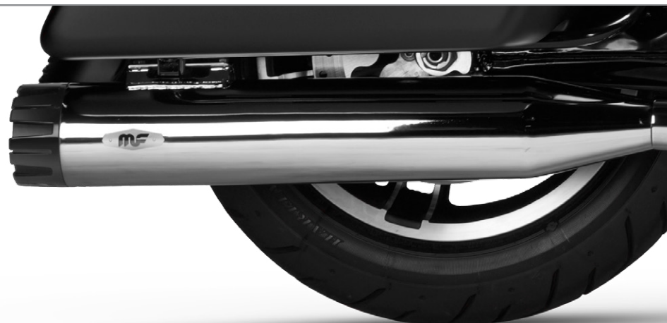
SYSTEM SHOWN IN CHROME